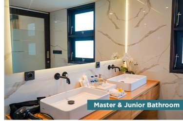
Master & Junior Bathroom

7 bedrooms: 5 king-sized beds, 2 twin beds, each with en-suite bathroom