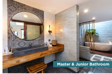
Master & Junior Bathroom

7 bedrooms: 5 king-sized beds, 2 twin beds, each with en-suite bathroom