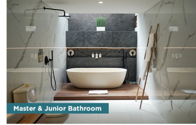
Master & Junior Bathroom