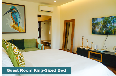
Guest Room King-Sized Bed