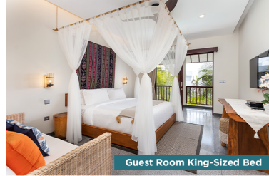
Guest Room King-Sized Bed