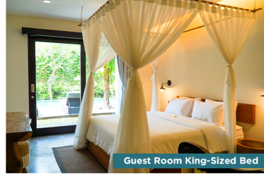
Guest Room King-Sized Bed