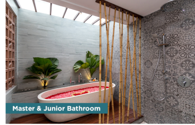
Master & Junior Bathroom