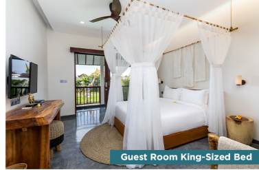
Guest Room King-Sized Bed