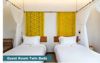
Guest Room Twin Beds