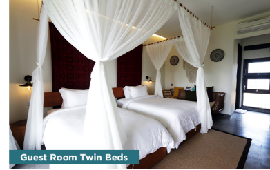
Guest Room Twin Beds