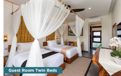
Guest Room Twin Beds